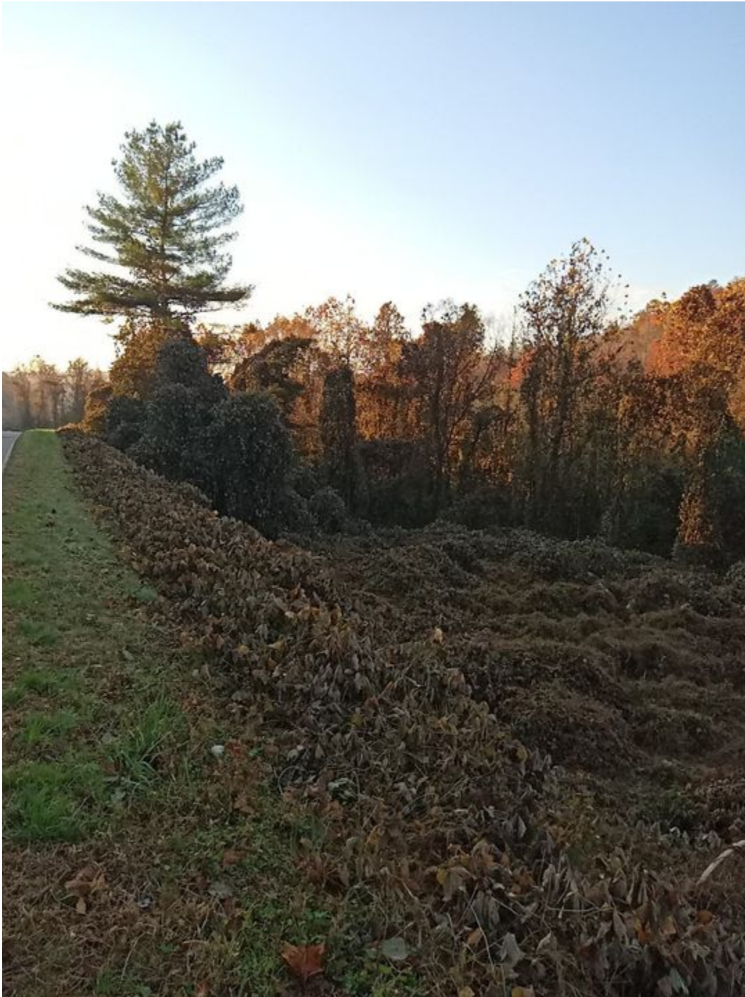
Date & Time: November 7, 2025 7:57 AM Location: 35.202677, -83.341517 Photo Direction: South